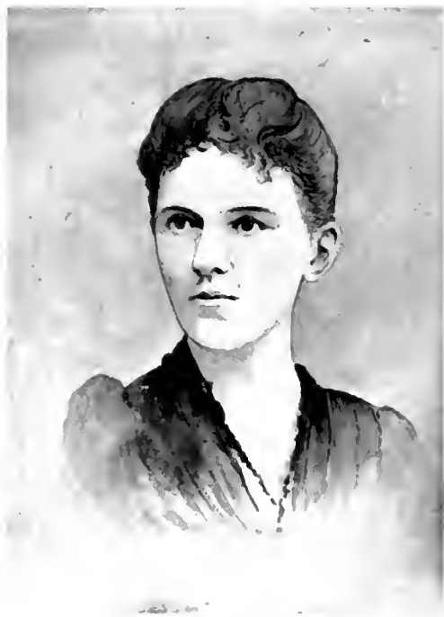
VARINA ANNE DAVIS.

attended a boarding-school and was joined by her parents. Miss Davis studied drawing and the drama, and her experience convinced her that it is folly to send American children to Europe to be educated. Leaving Paris with her parents, they returned to New Orleans, La., where in the following spring Miss Davis made her entrance into society at the Mardi Gras Ball. The family were invited to visit Alabama and were received with distinction. They extended their tour to Atlanta, Ga., and there Governor Gordon presented Miss Davis to the people as "The Daughter of the Confederacy." She went to Paris, on the advice of her physicians, and was ill there at the time of her father's death. She has made her home with her mother in Beauvoir, Miss., the family residence since 1879. Miss Davis has recently shown literary talent of a high order and has contributed to a number of periodicals. She is an accomplished musician, a skilled